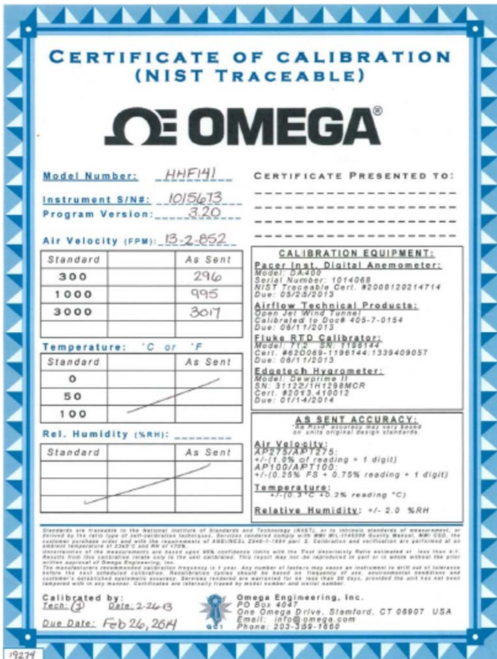
Figure A2 Calibration certificates of anemometer