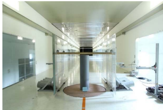
Figure A1 Installation of PVC cylinder

The experimental setup is shown in Figure 1. The leading edge of the test models was located at 2.8 m from the inlet of test section. In Figure 2, the testing models were installed on the force-moment sensor. Two side acrylic boards were installed. The distance between the edge of the cylinder and acrylic was 2.5 diameter of the PVC cylinder.